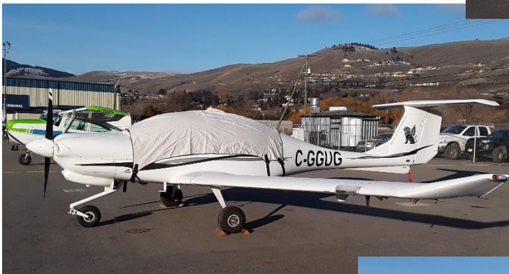
C-GGUG Diamond DA 40F 2007 Wu Hao Coquitlam, BC