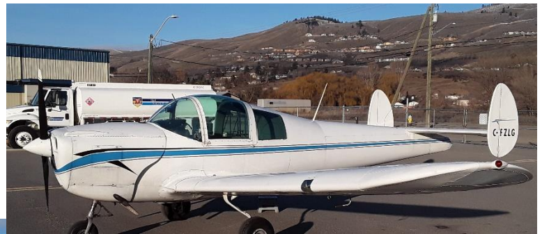
C-FZLG Alon A2-A (Aircoupe) Royal Flying Corps School of Aerial Fighting Ltd. (plus 4 other owners) Oliver, B.C.