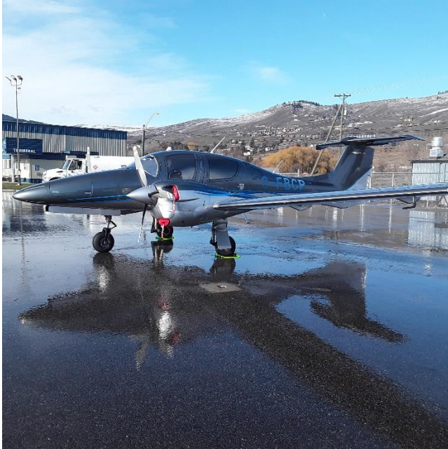
C-FBCP Twin Diamond DA 62 Registered to IFLY Charter Inc. Charles Guimont flew 13 hours from Quebec to Vernon with a few days spent in Calgary waiting for a weather window. It was a gorgeous day but the ramp was a skating rink!